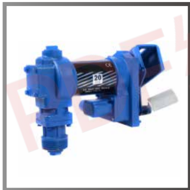
Fuel Transfer Pump